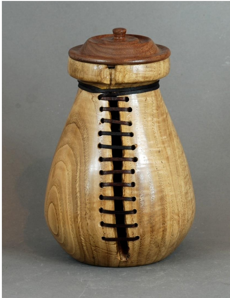
Michael Zeller's laced Chesnut vase with walnut lid