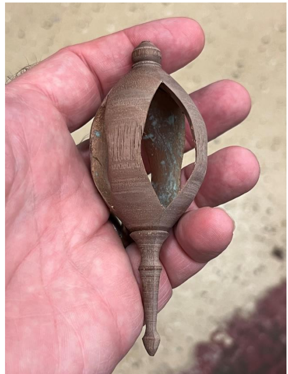
Close up of “inside out” turning Barry demonstrated at October meeting