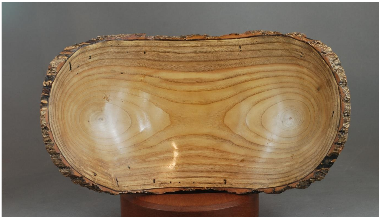
Rich Conley's iridescent painted Sycamore bowl (above) and natural edge Sassafras bowl (below)