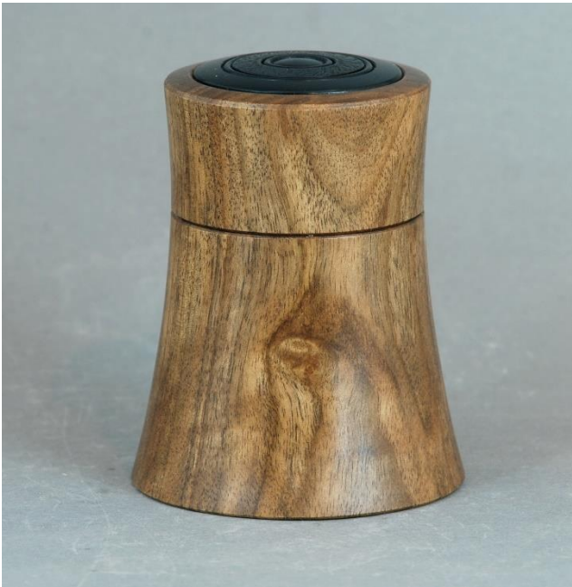
Phil Reed's English Walnut box with threaded lid