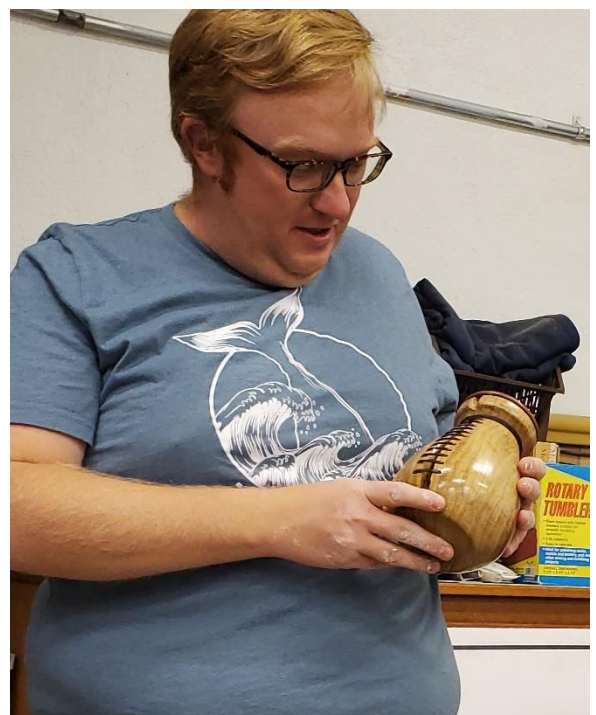
Michael Zeller's laced up Chestnut vase