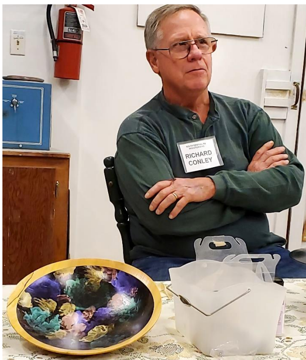
An example of Rich's iridescent painting on the interior of a bowl