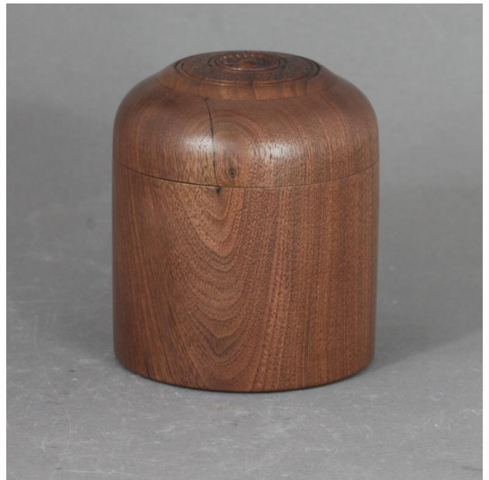
Barry Stump's Spalted Maple and Walnut boxes