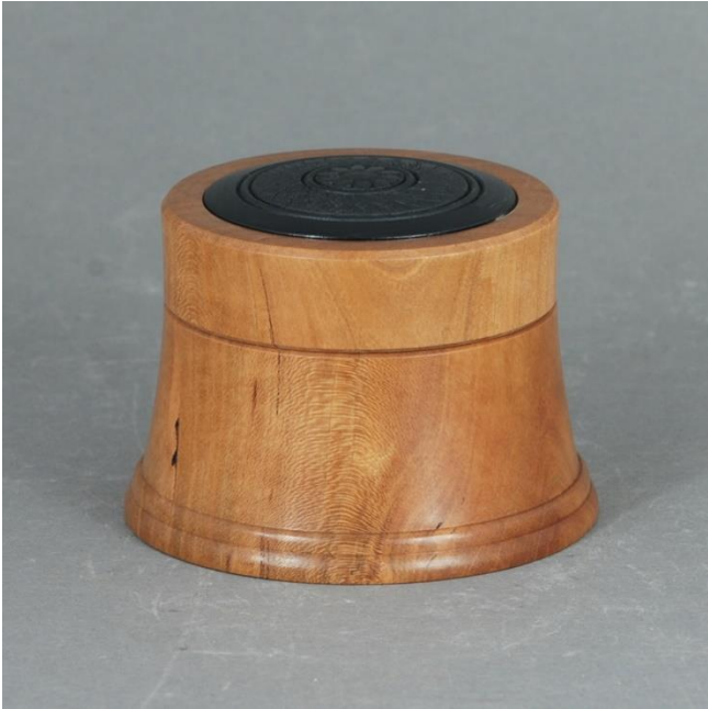
Phil Reed's Cherry box