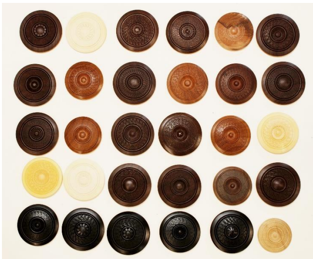
Phil Reed's hardwood medallions