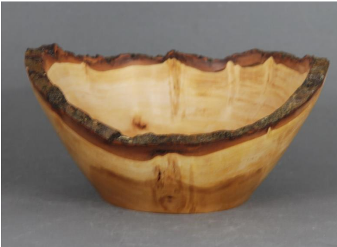
Rich Conley's natural edge Willow bowl