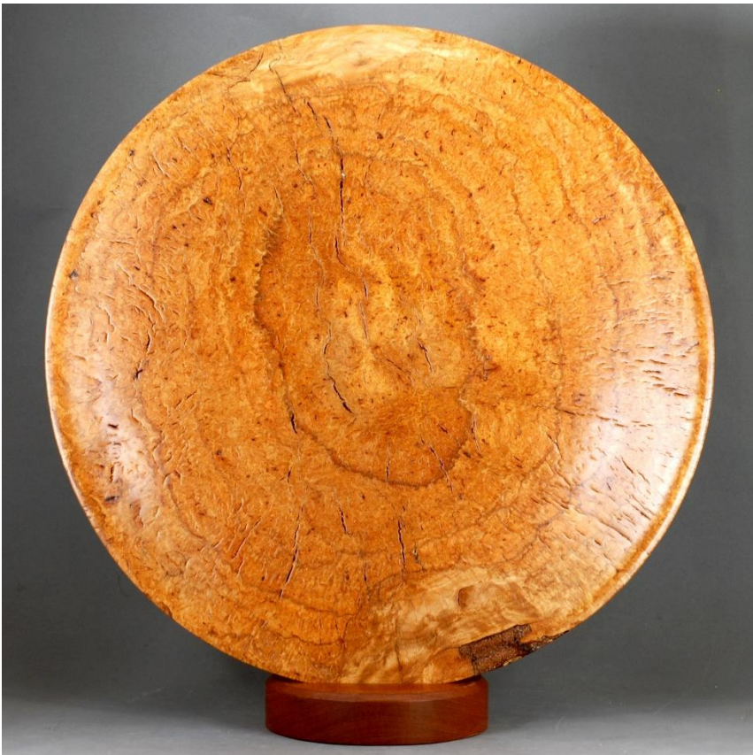
Jon Amos' large Ironwood burl platter