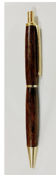
Charlie Stuhre's Desert Ironwood pen