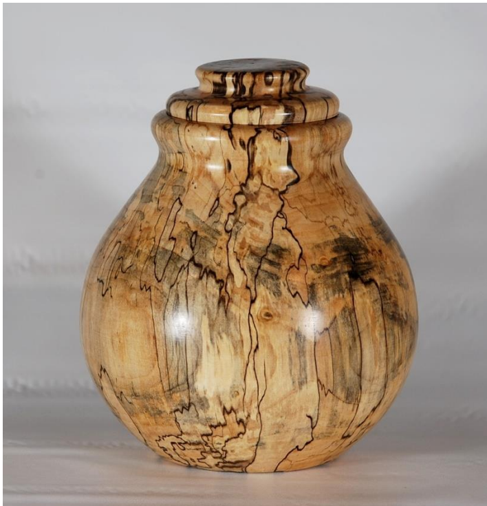
Don Wilson's Spalted Birch lidded pot