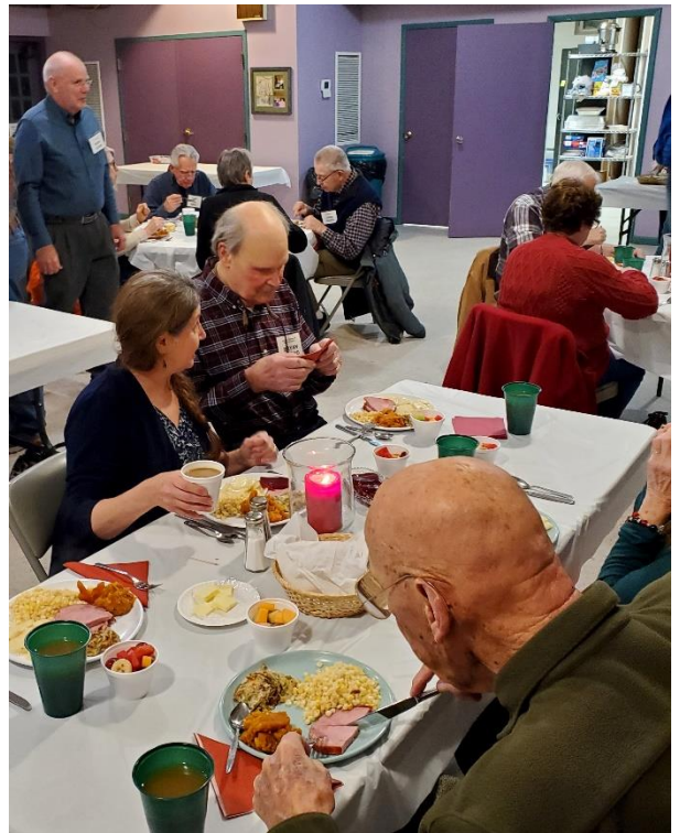
Enjoying the meal at Holiday Party