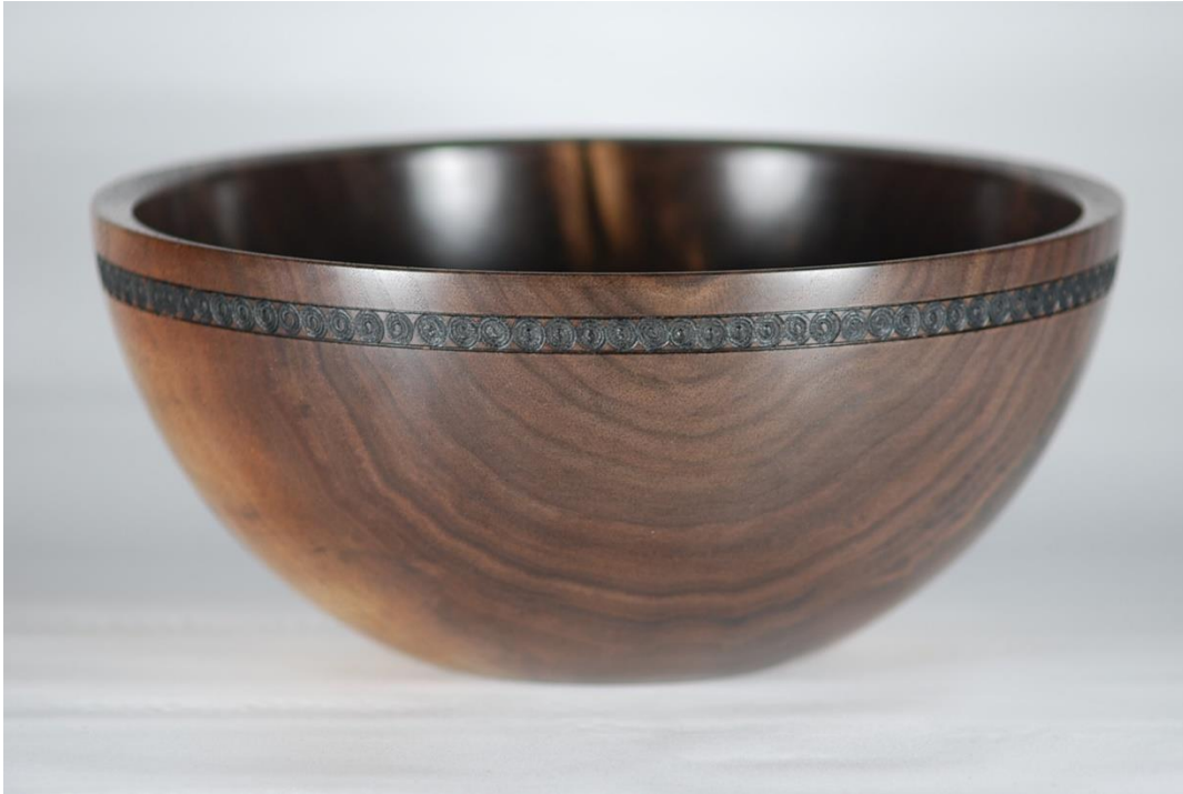
Phil Reed's Walnut bowl