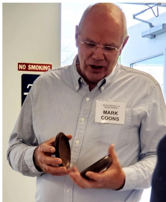
Mark's walnut lidded container