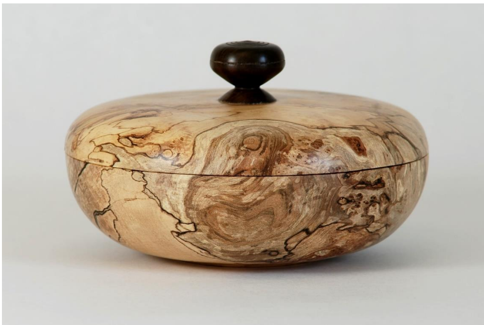
Barry Stump's Spalted Maple covered bowl