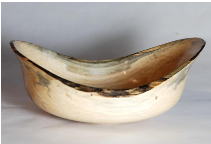
Paul Miller's Rosewood vase (left), natural edged Maple bowl (right) and large Spalted Fig natural edged bowl (below)