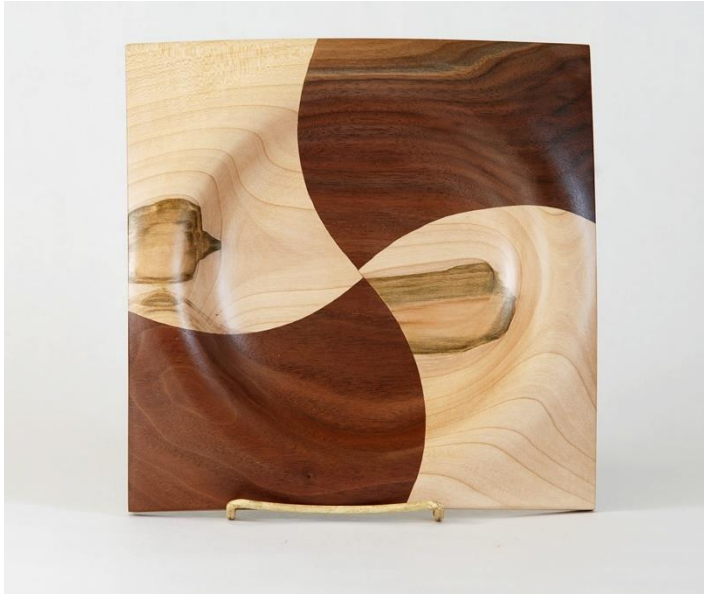
Barry Stump's Maple & Walnut square plate