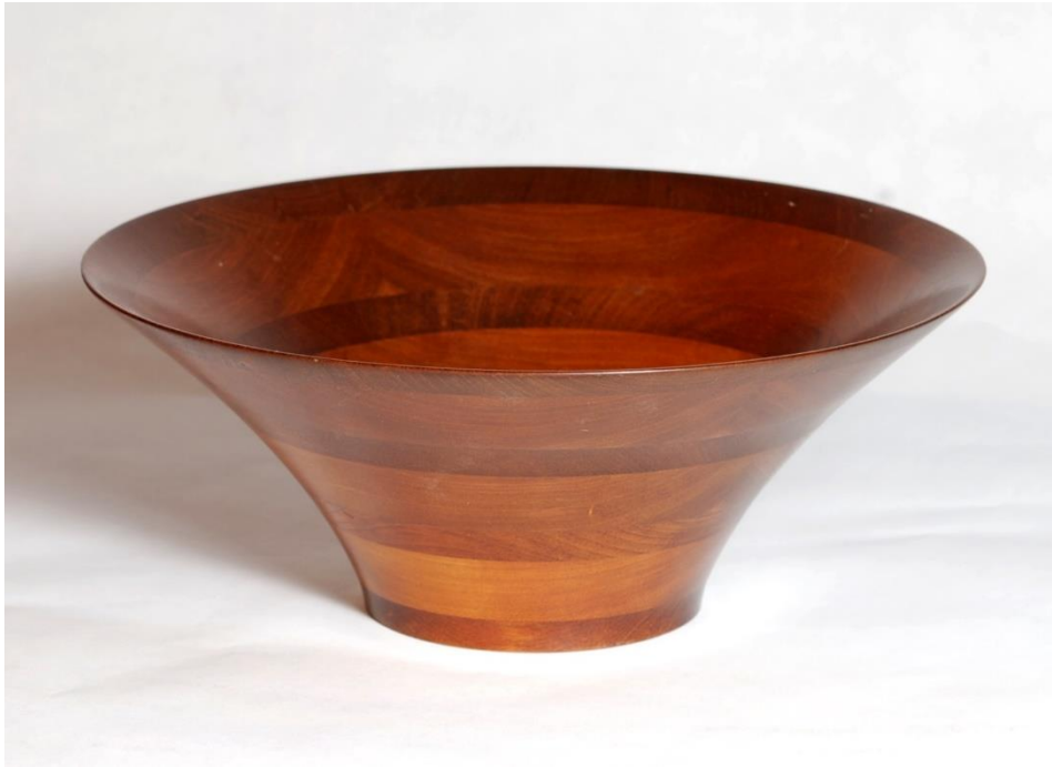
Phil Reed's Walnut & Cherry bowl