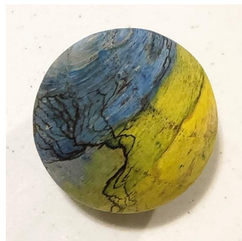
Transtint dyes in alcohol