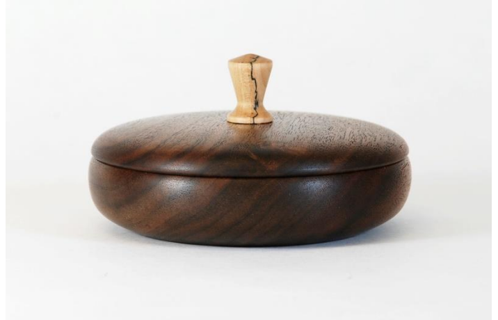
Mark Coons' Walnut & Spalted Maple lidded box