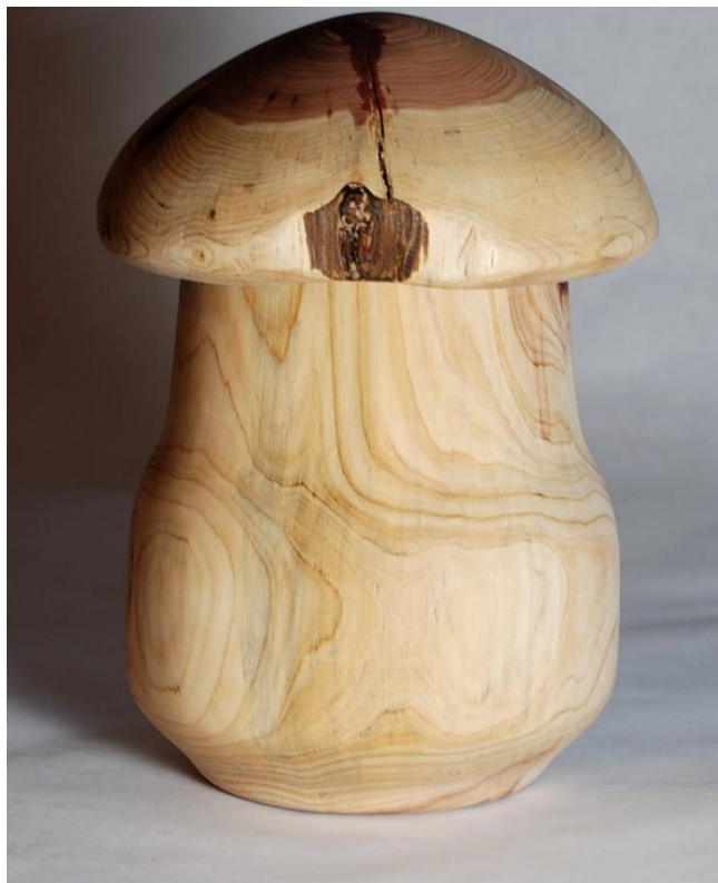
Tom Deneen's Cedar mushroom box