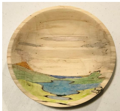
Colored Pencil with water wash