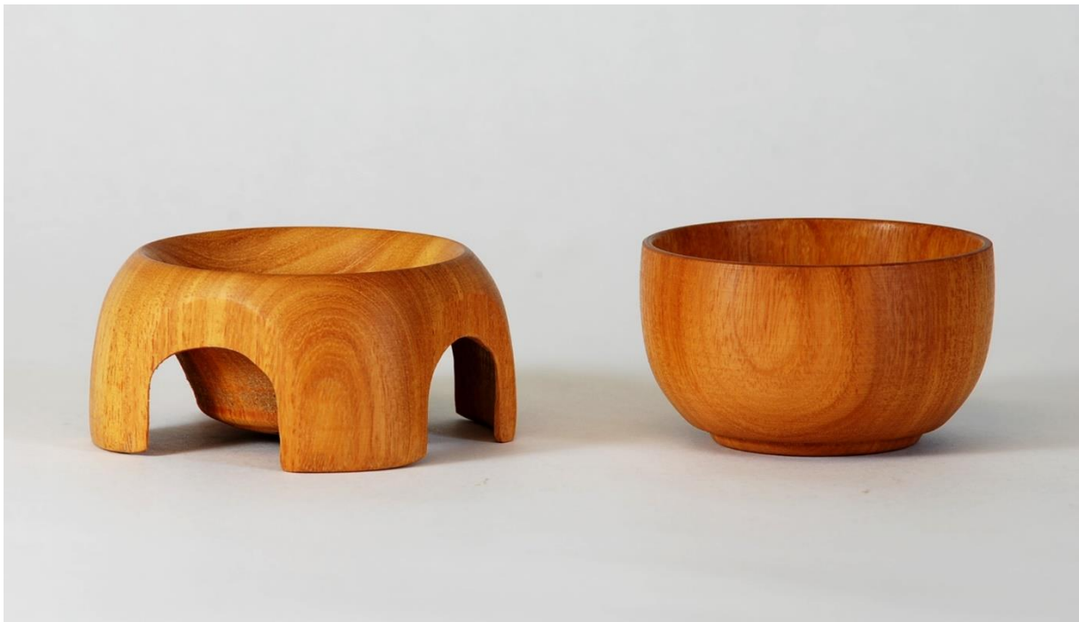
Tom Deneen's two Canary wood bowls