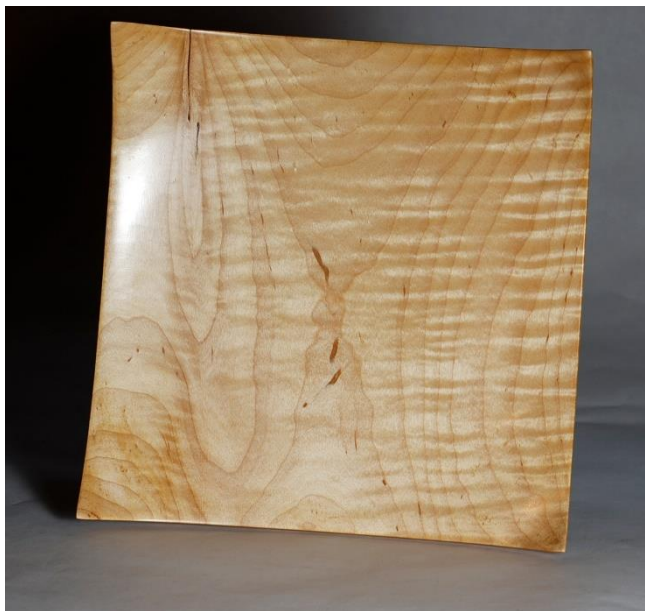
Paul Miller's square Curly Maple plate