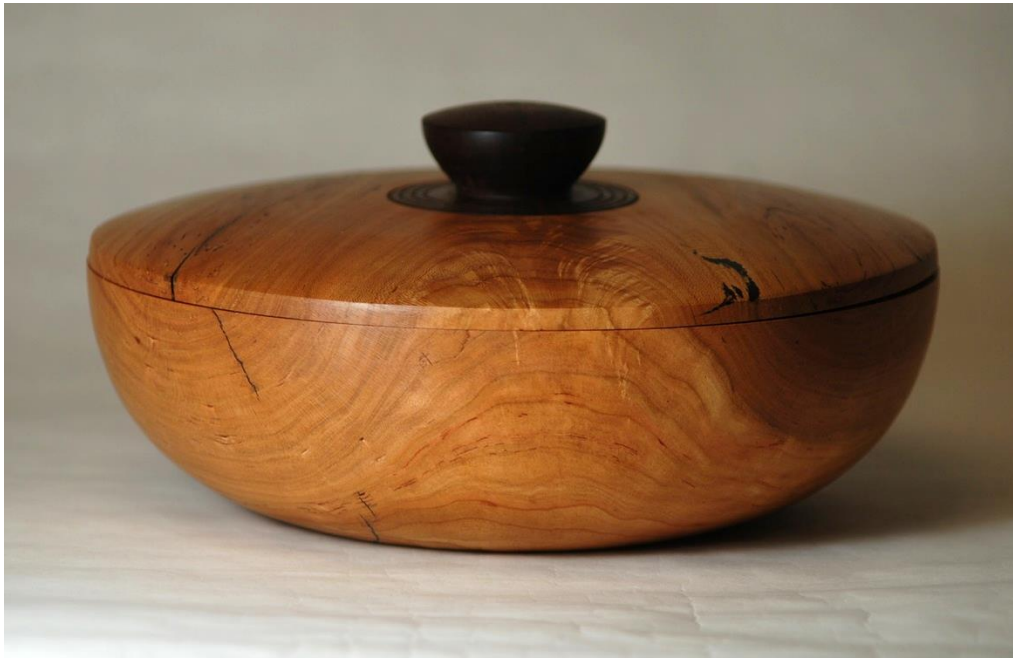
Don Pickel's lidded cherry & walnut bowl