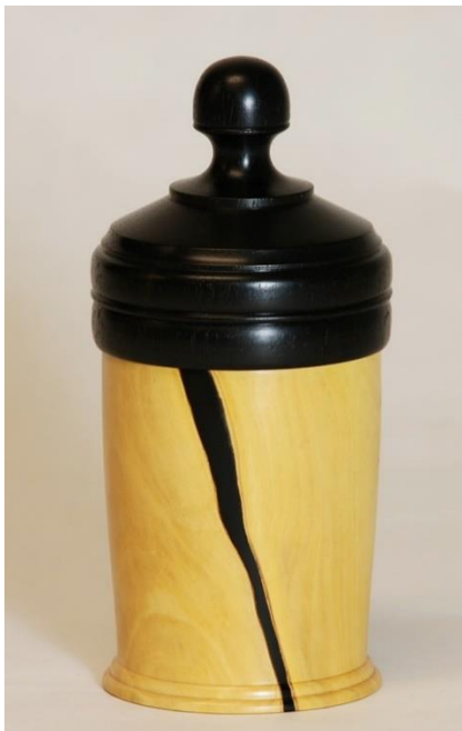
Phil Reed's Boxwood & Blackwood box