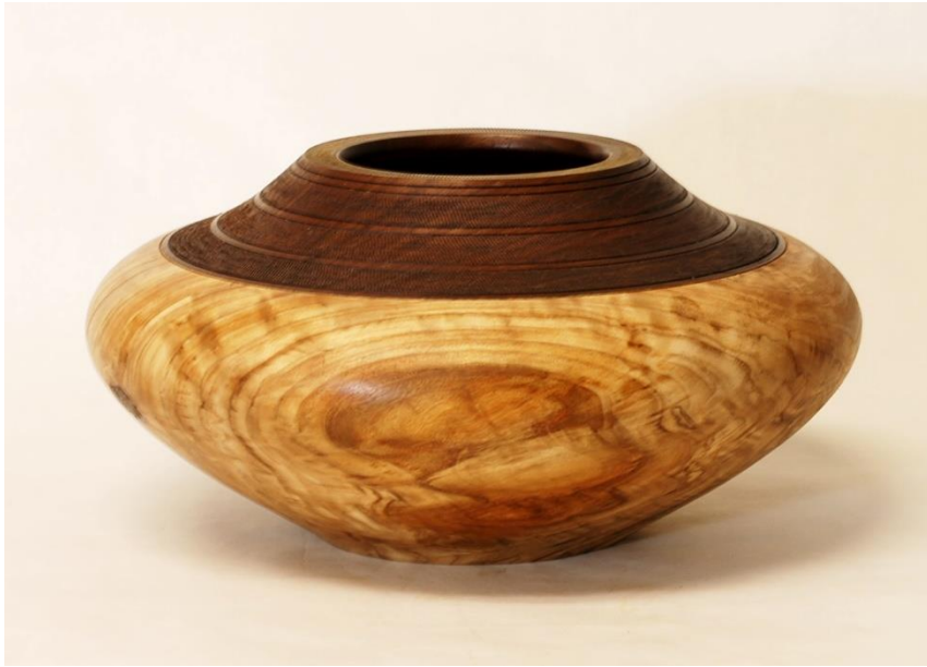
Don Pickel's textured Poplar and Walnut hollow form