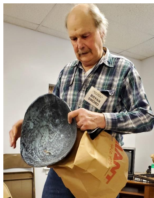
Bryan Sword's natural edge bowl with metallic finish