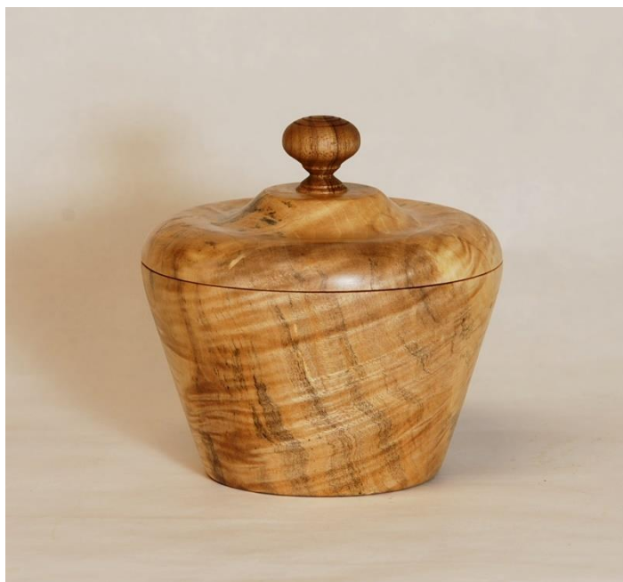
Barry Stump's spalted maple lidded container