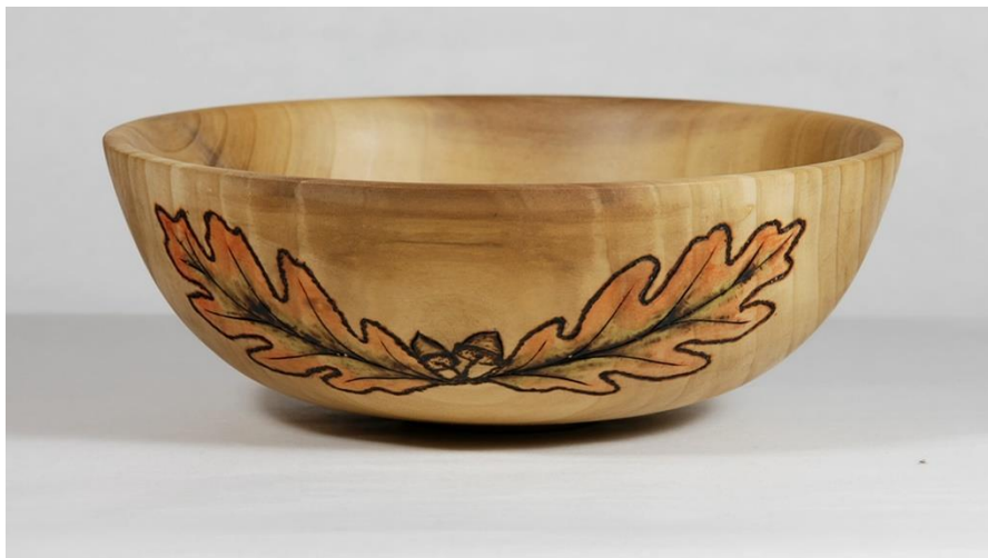
Barry Stump's Poplar bowl with burned leaf motif