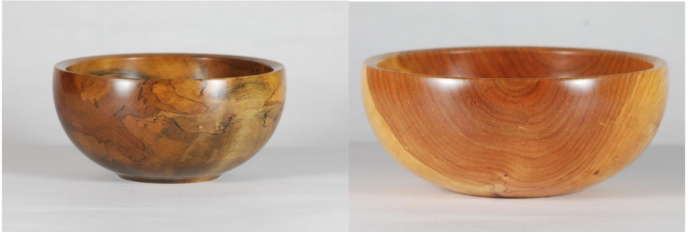
Phil Reed's stained and fumed Spalted Maple bowl and Maple bowl