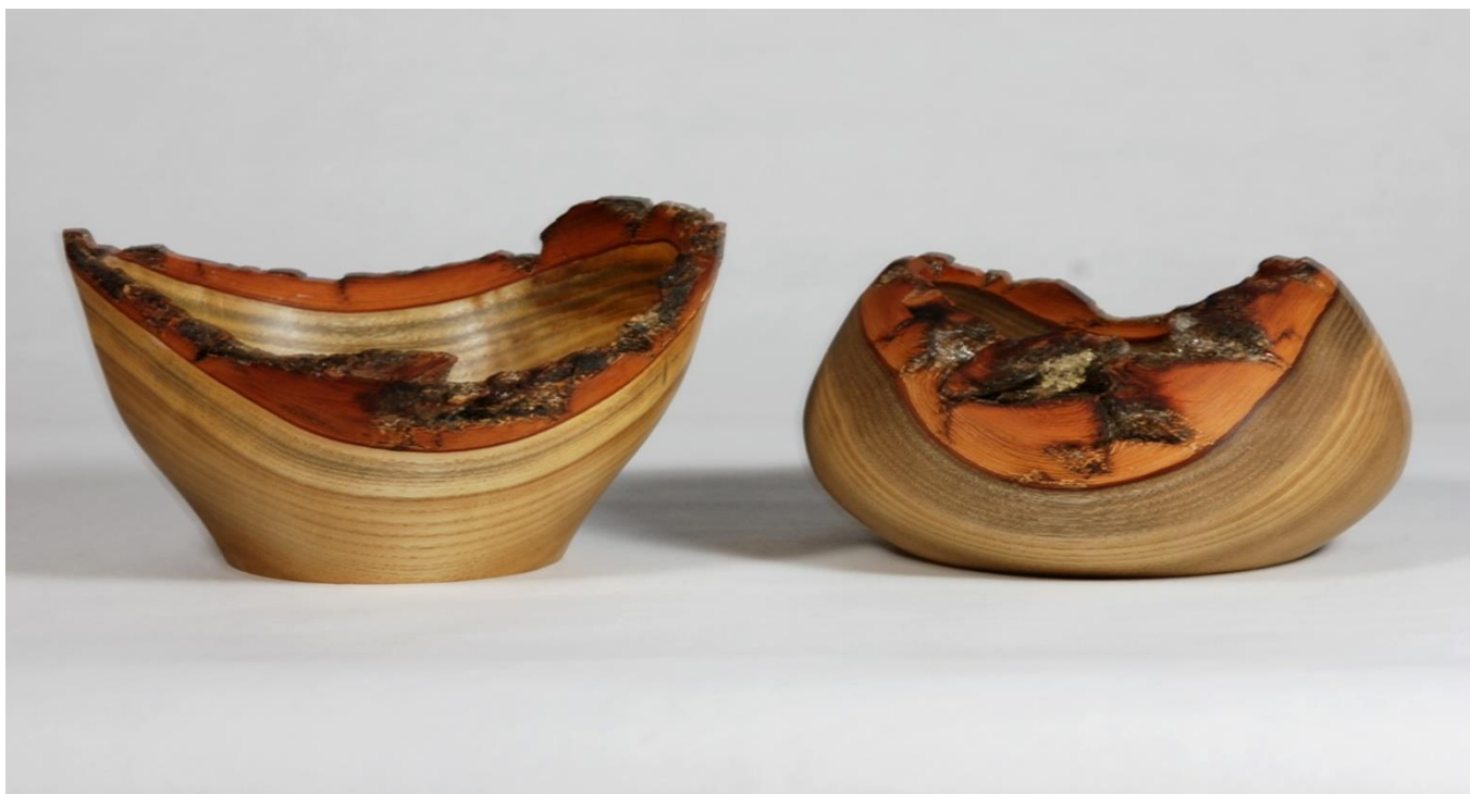
Ed Drabik's two Sassafras live edged bowls