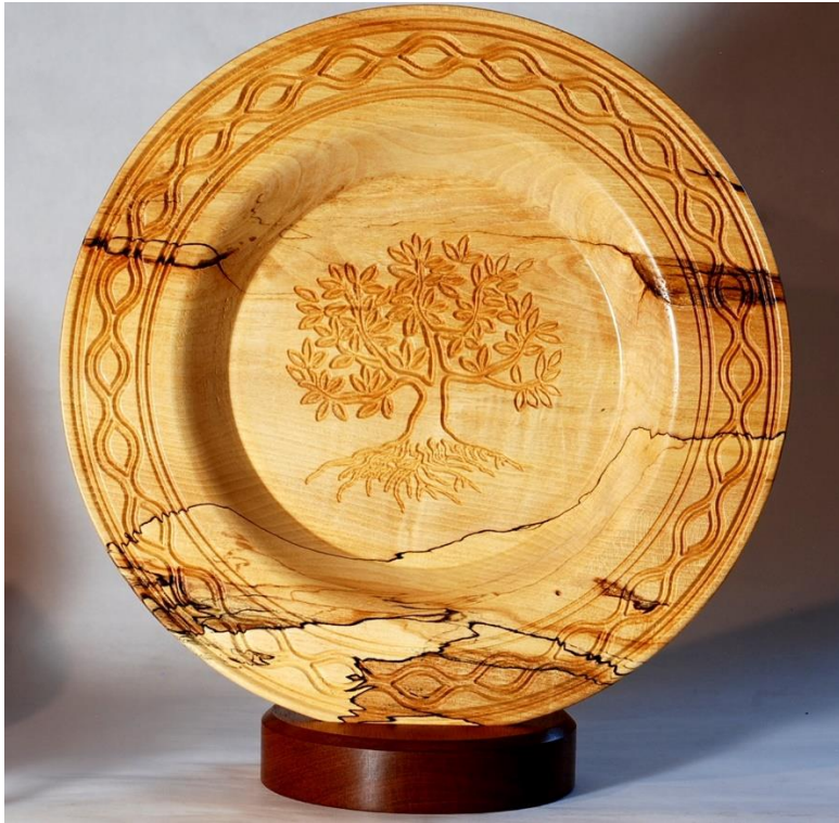
Joel Persing's Spalted Maple bowl with detailed carving