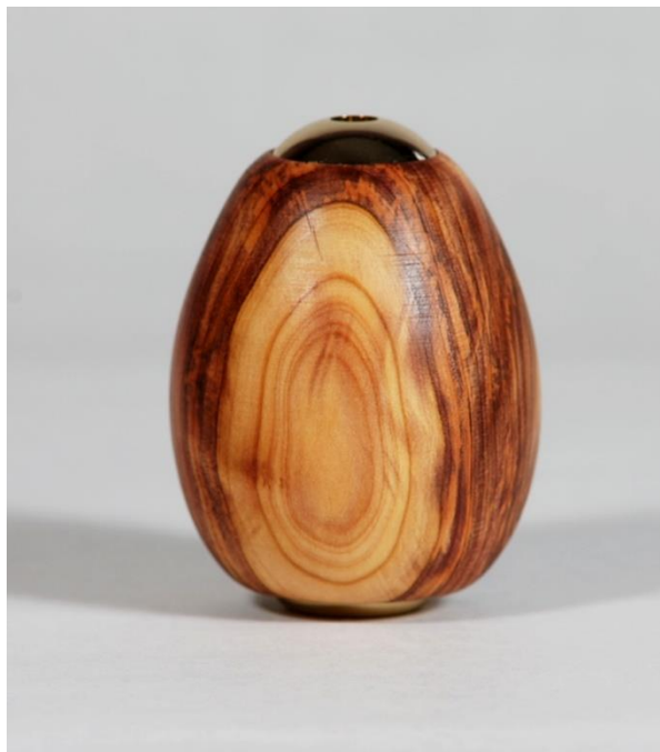
Tom Deneen's Juniper egg kaleidoscope