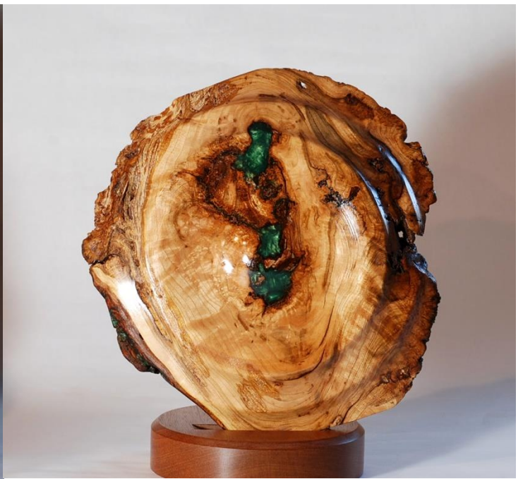
Rich Conley's Cherry Burl and resin wall hanging