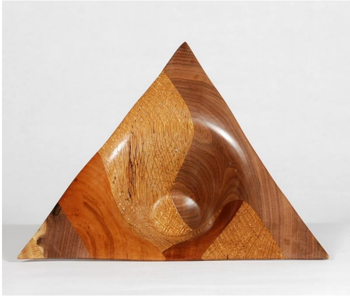
Bryan Sword's 3 corner Oak/Walnut/Mahogany bowl