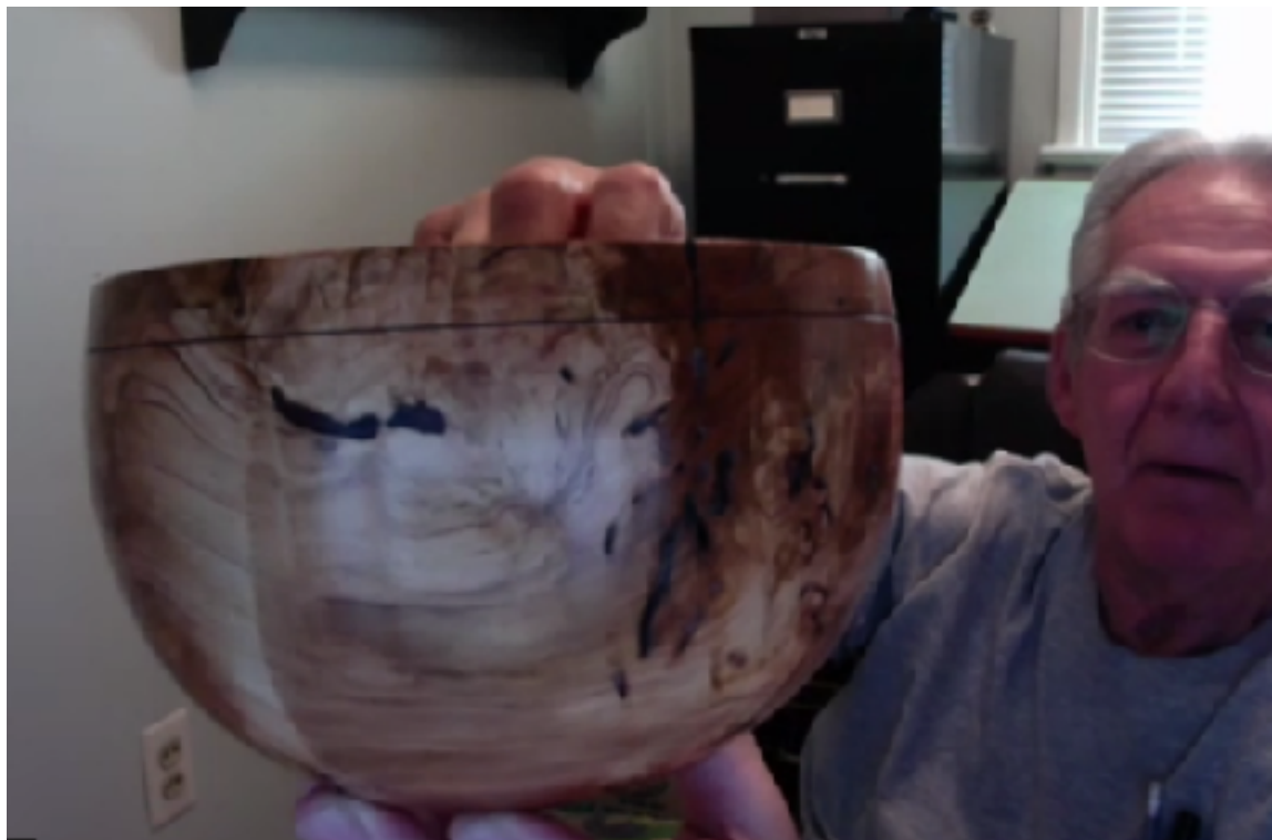
Phil Reed's bowl with a well rounded shape.