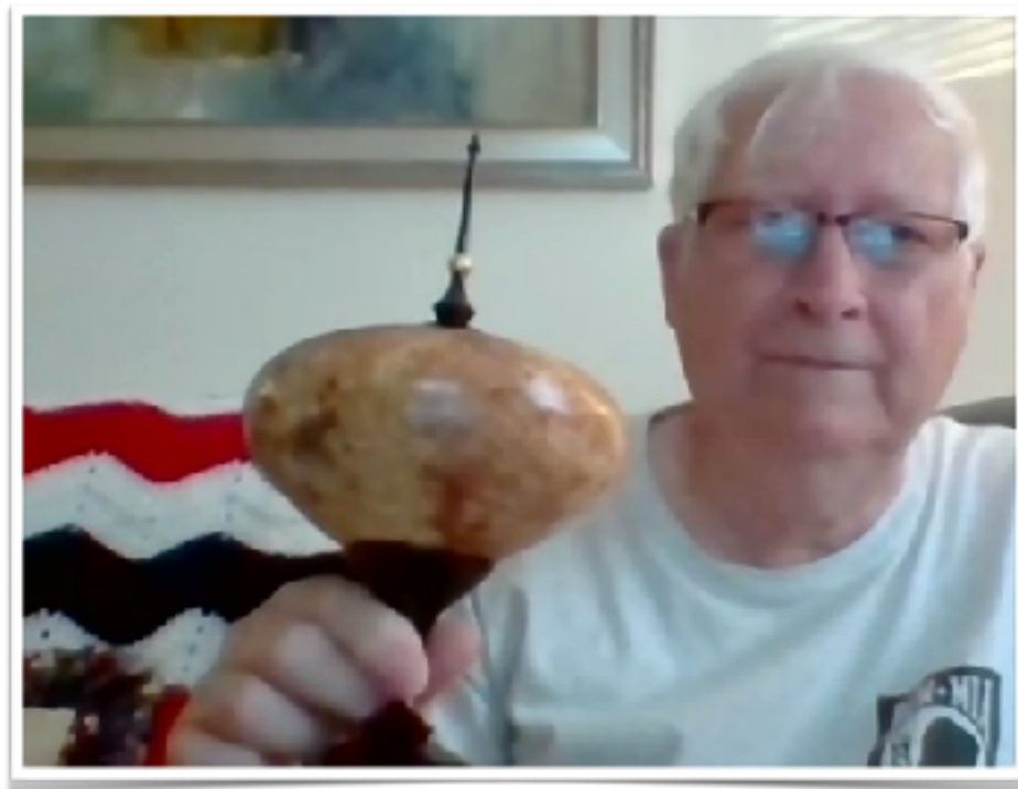
Barry's lidded vessel