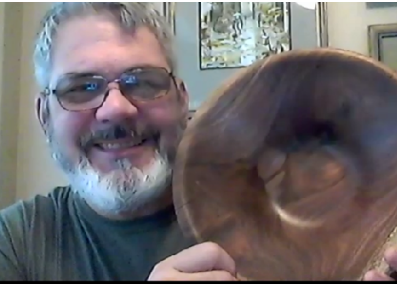
Ed's nice bowl