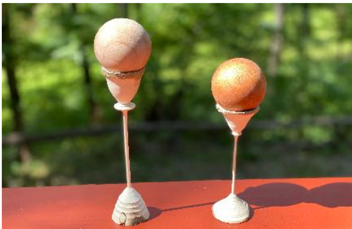
Dave Neuburger's two long stem goblet with turned spheres of maple and mahogany