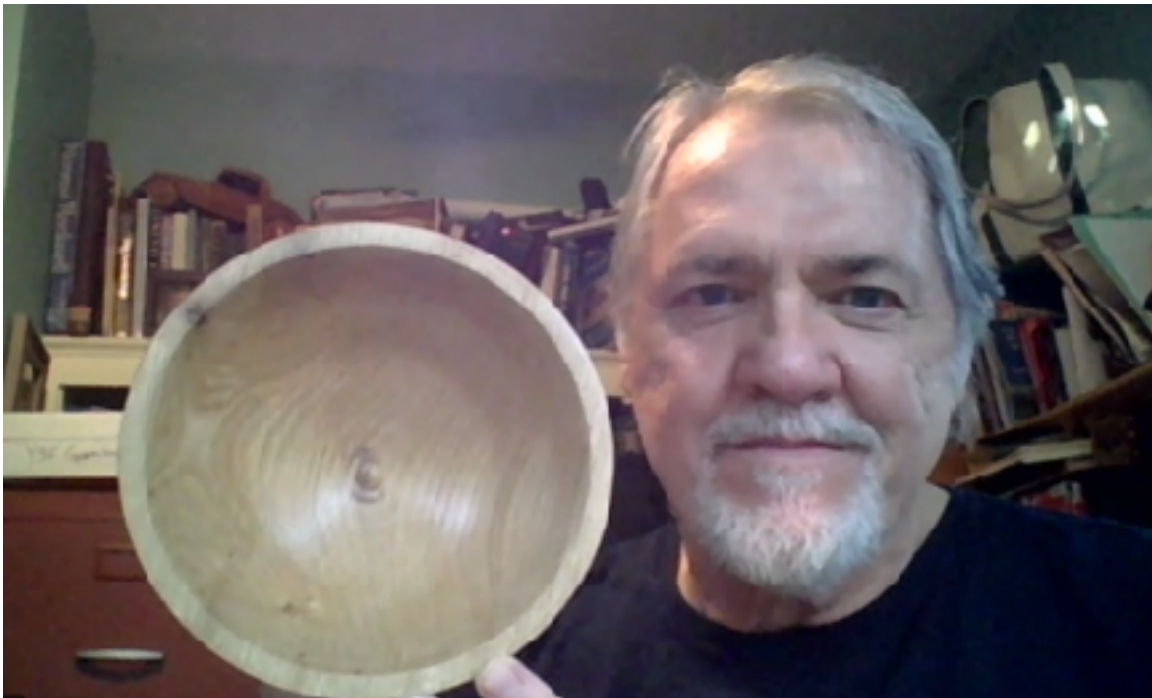
Craig Zumbrun's oak bowl