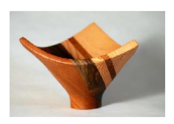
Bryan Sword's 3 cornered bowl of mixed woods