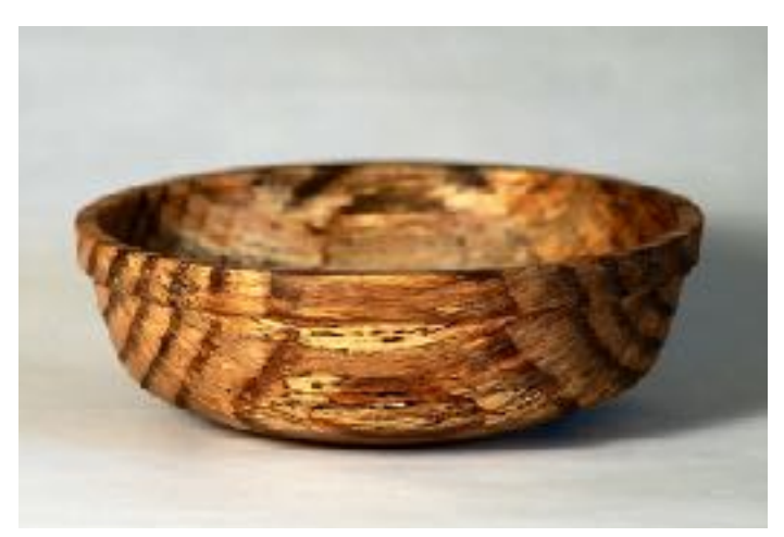
Three bowls by Leo Deller of beech, white oak and spalted maple