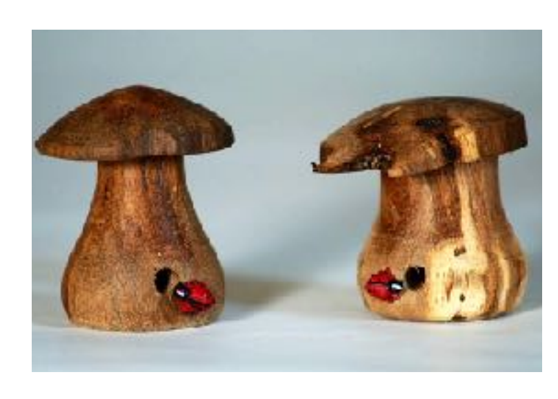
Tom Deneen made two mushrooms out of grape vine