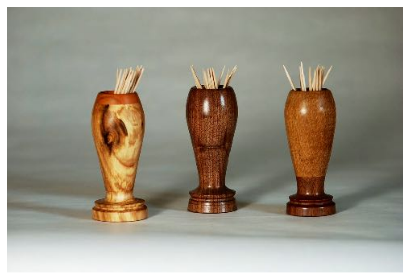
Bill Krofft toothpick holders out of sycamore, walnut, and cherry