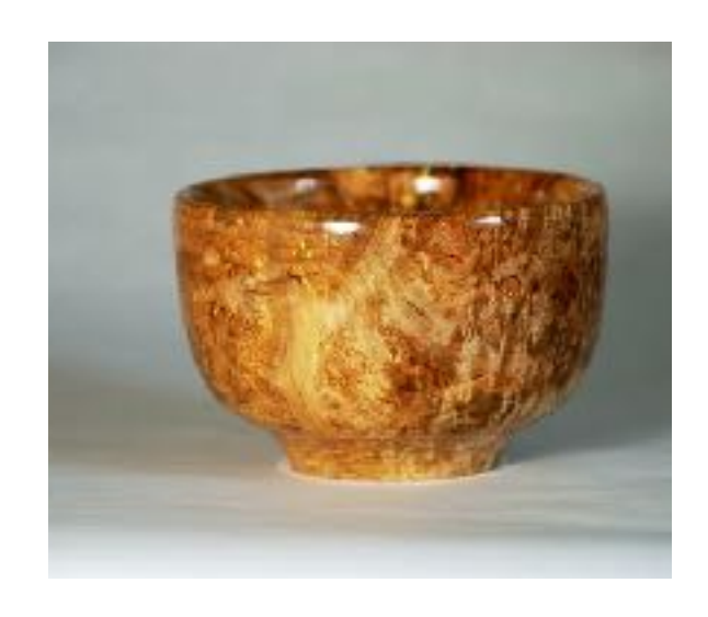
Bill Runkle maple burl bowl