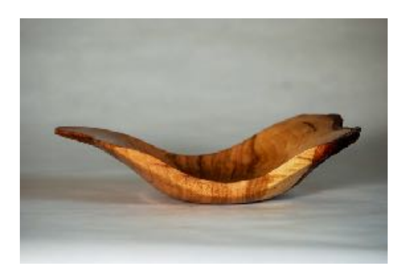
Jack Kapp bowl out of apricot