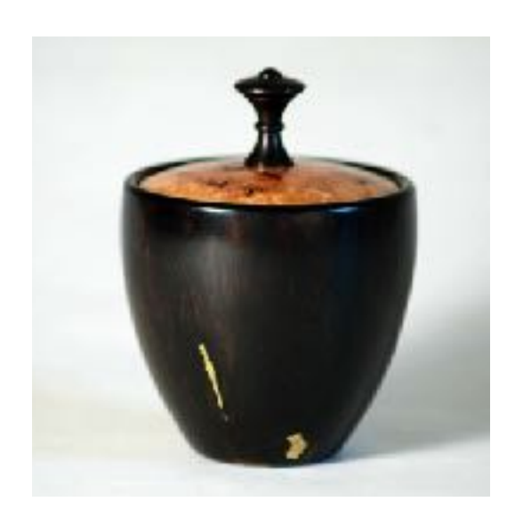
Phil Reed box of blackwood and cherry burl