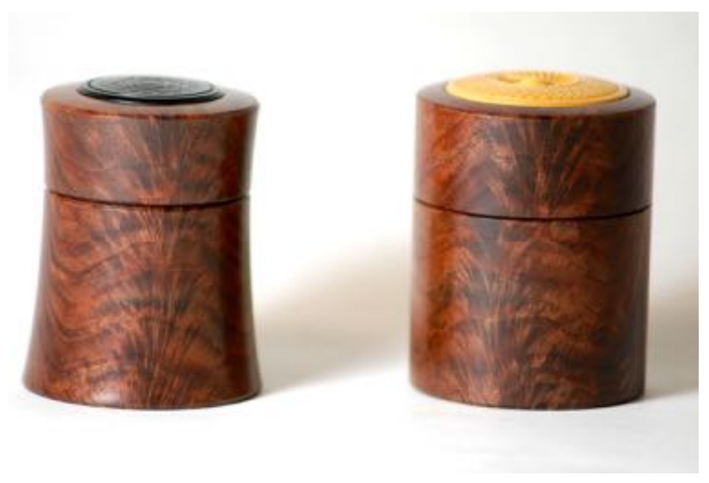
Phil Reed's boxes out of walnut, boxwood and blackwood