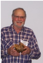
Bryan Sword Mushroom box Spalted Yellow Birch Meticulously and delicately carved mushroom-like vanes on underside of top.