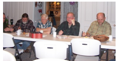
Great minds at work