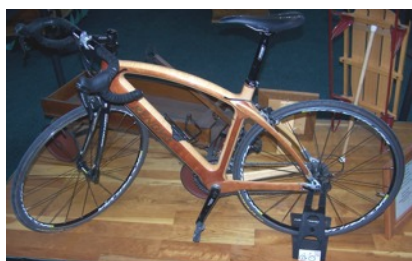
Laminated wood frame bicycle