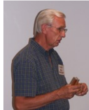
Bill Fordney Mahogany Bottle Stoppers Cigar Pens Mahogany and concalo halves, both with buckeye burl ends