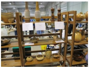
Ready To go!