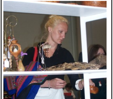
Don't just look, please purchase!