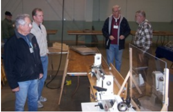
Planning meeting, great minds at work!