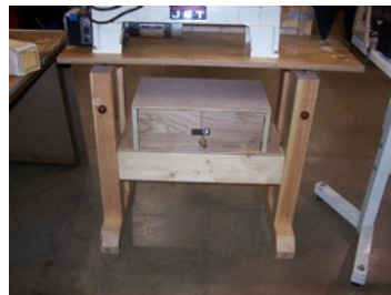
An adjustable lathe bench made by Bill Fordney