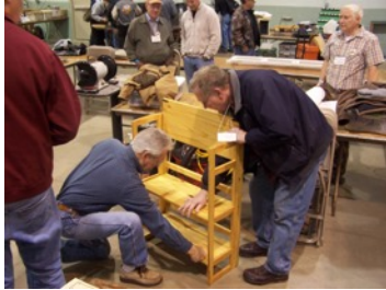
No, I think it goes this way.