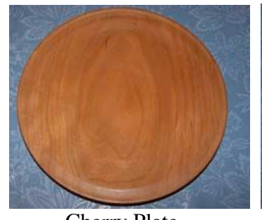
Cherry Plate Joyce McCormick