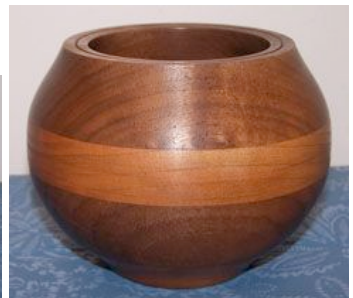
Small Bowl walnut & cherry Jim Morrow