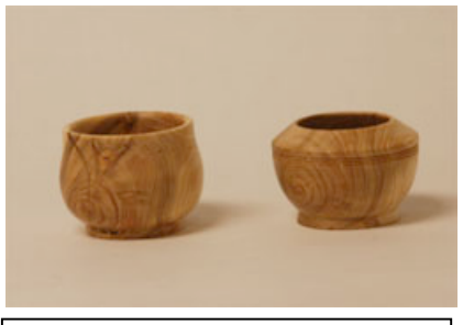
2 Small Bowls Unknown wood scraps Alvin Herner