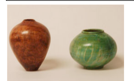
2 Dyed Maple vessels Mike Galloway