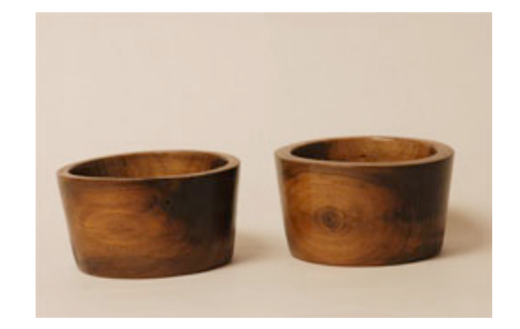
2 Walnut Bowls Elmer Absher