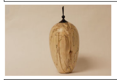
Spalted Maple Hollow Form Phil Reed