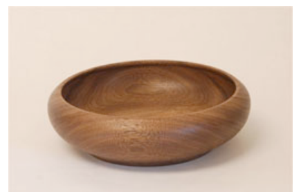
8"d. Walnut Bowl Barry Stump