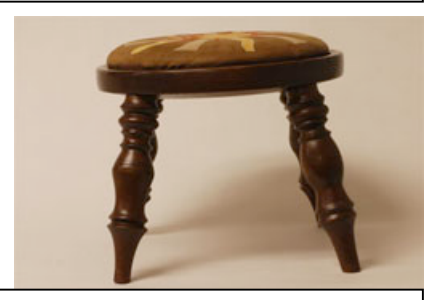
Walnut/Deer Hide stool Dave Neuberger