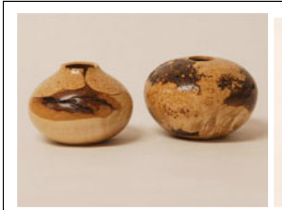
Phil Reed Hollow forms, maple burl