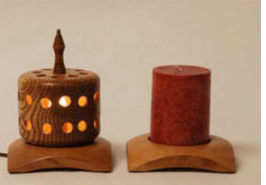
Elmer Absher Square-foot design bases cherry & boxwood