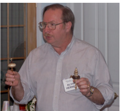
Al Herner Ornaments, silver maple, rock (maple, walnut)