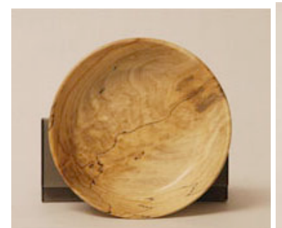
Barry Stump 6" Spalted Maple Flat bowl