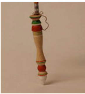
Carol Woodbury Spindle ornament