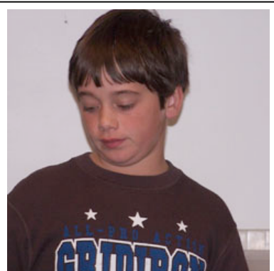
Tom Frey made a pen from Bocote wood but we don't have picture of it.