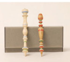
Barbara Palastak Spindle Ornaments maple & mahogany