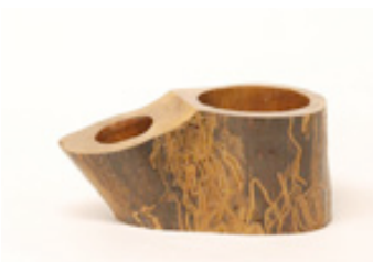
Worm Dog Wood, 1 red oak, Elmer Absher