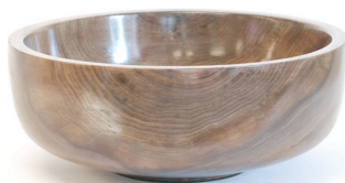
Walnut Bowl Elmer Absher