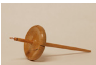
cherry drop spindle Tom Deneen