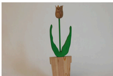
Flower Al Herner