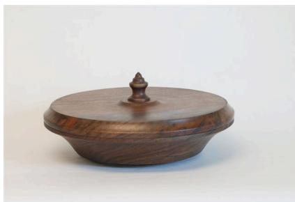
Walnut bowl lidded Don Nalor