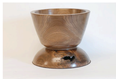
Walnut Bowl Elmer Absher