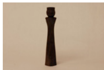
Walnut candlestick Don Wilson