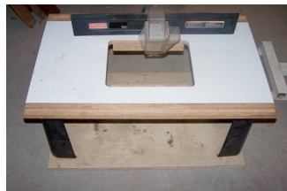
Router table w/ fence $30