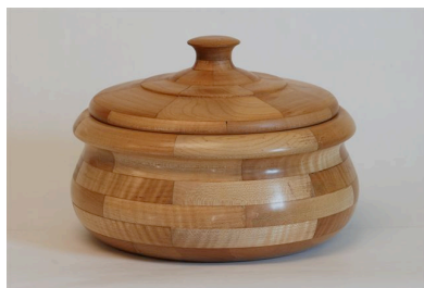
Birch Box Don Walkemever