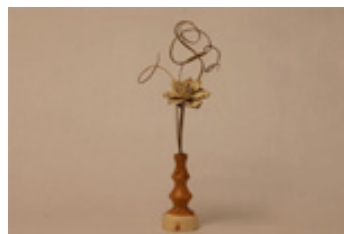
Walnut Inkwell Joyce McCormick