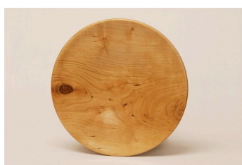
Cherry plate Bennett