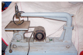
Walker-Turner Scroll Saw 22" throat on stand - $75 or reasonable offer

This is where you can sell shop related stuff. Ads must be in a format that can be pasted into the newsletter, not typed by newsletter editor.