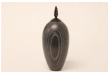
Ash Hollow Form Phil Reed