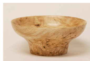
Cherry burl bowl Kay Pomroy