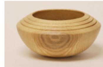
Walnut sapwood Bennett