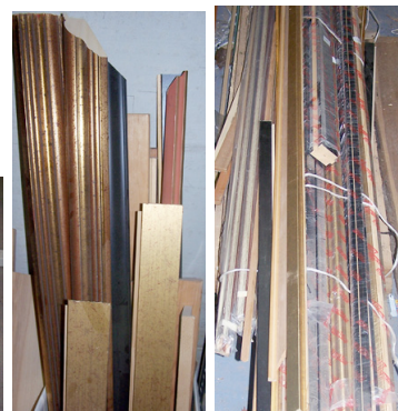
Picture Framing Molding selling for widowed sister-in-law Reasonable offer