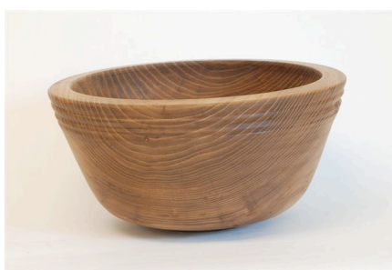
Rock/Cork bark elm Tom Deneen