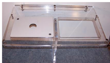
Bench Dog Router Table Top 1" acrylic w/2 template holes 1 universal template $75