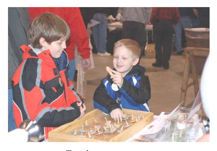
Two happy customers