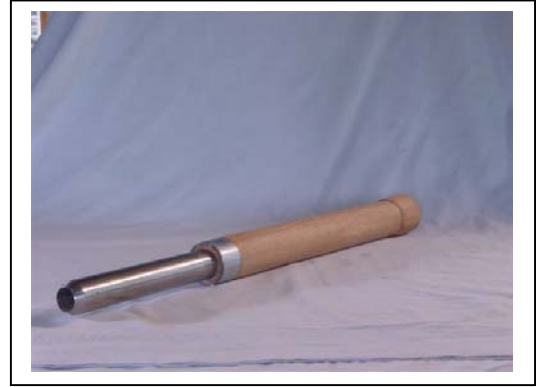
Hollow turning tool by Elmer Absher You can connect a vacuum hose to the end of the handle to suck up the shavings as you are turning.