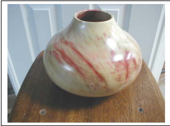
More beautiful Box Elder turning by Phil Reed