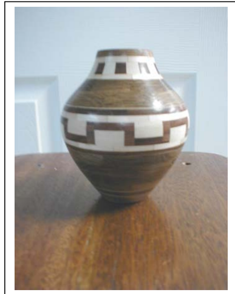
English Brown Oak and Maple small segmented vase by Mike Galloway. NOTE: DO NOT use Tite Bound III glue on light woods it is dark and will show off all your joints. Tite Bound II is fine.