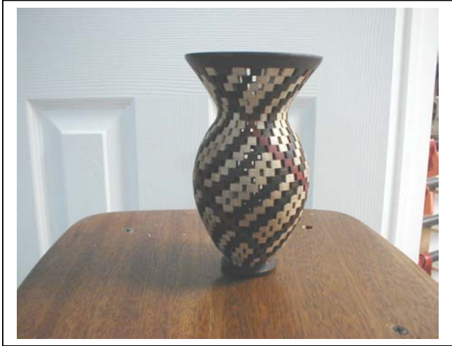
Open segmented vase by Dean Swagert. Made up of over 700 pieces of Bloodwood, Wenge and Maple