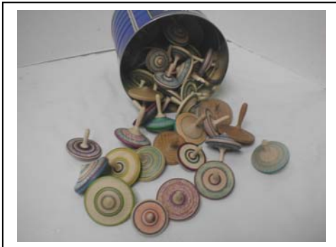
Can of Tops By Phil Reed