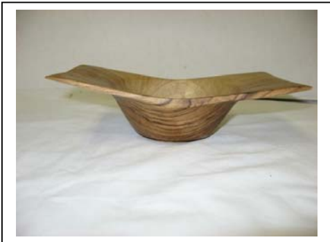
Beautiful wing bowl By Tom Deneen