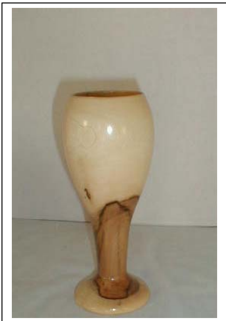
Maple goblet by Phil Reed