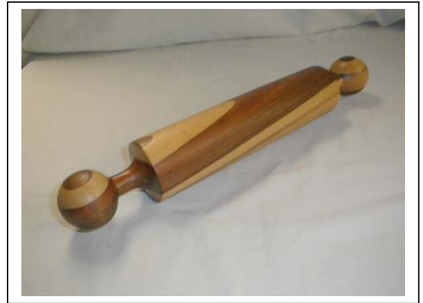
Rolling pin by Elmer Absher