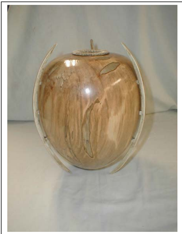
Hollow vessel by Dave Barkby. The legs are aluminum made to look like bone.