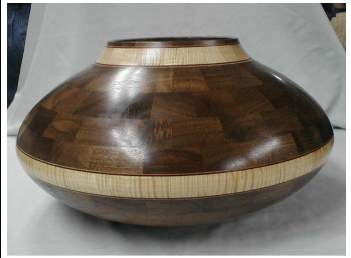
Walnut and Maple with red veneer segmented vessel by Phil Reed