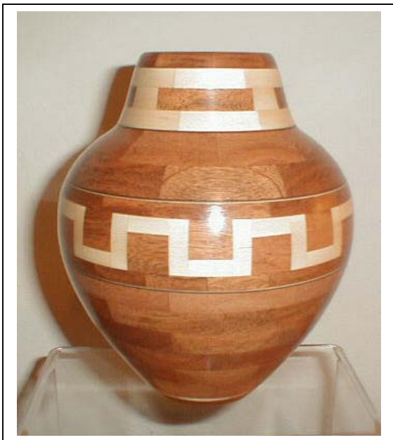
Mahogany and Maple with black veneer segmented vase by Mike Galloway