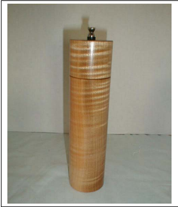
Pepper mill by Phil Reed