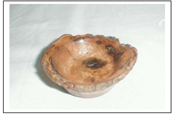
Very small (about 2 3/4 inch) burl turned by Don Naylor