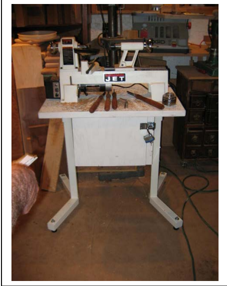
New lathe #1