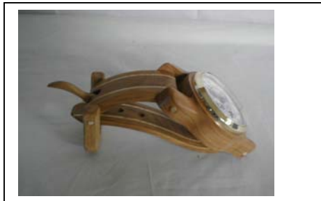
Side and front view of watch by Tom Elledge