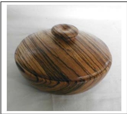
Zebra wood box