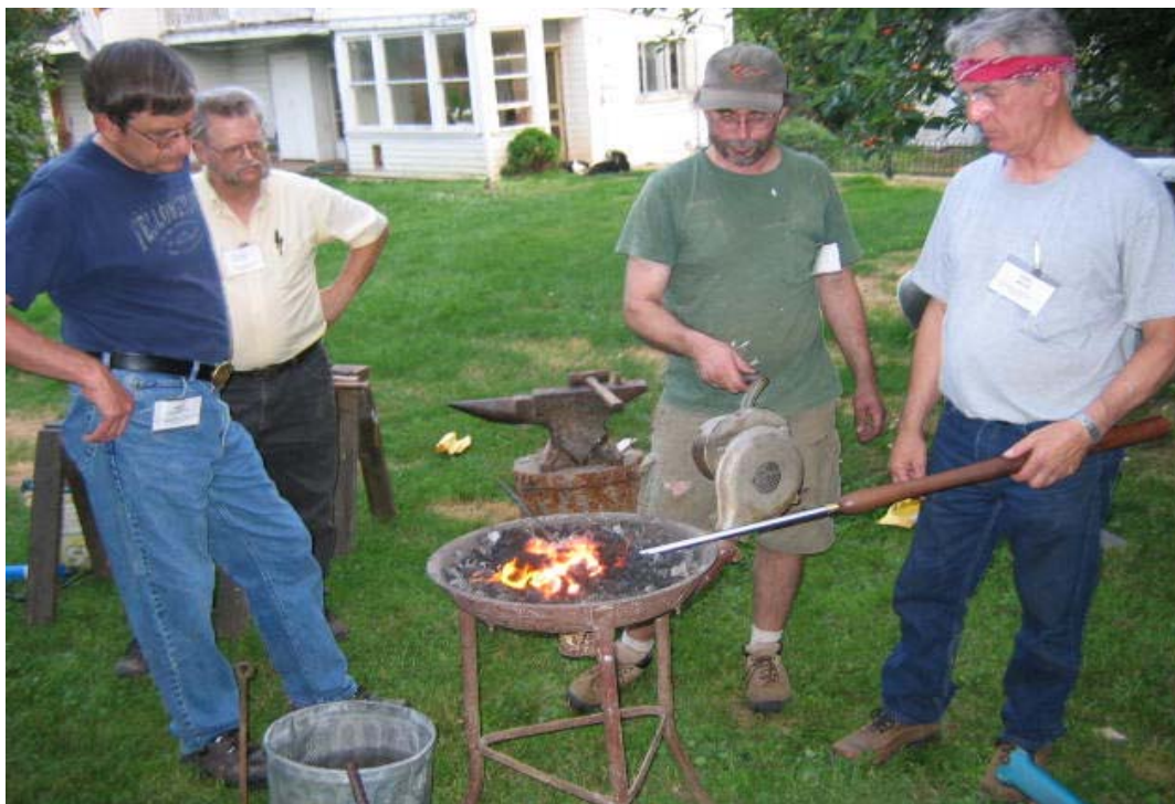
HOT tool making meeting

Newsletter of the South Central Pennsylvania Woodturners, July August 2005