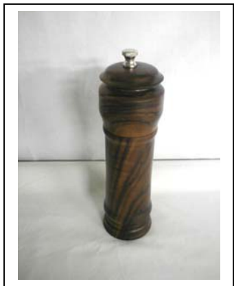
English Walnut peppermill