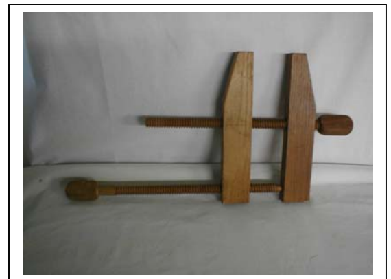
Oak Clamp by Elmer Absher