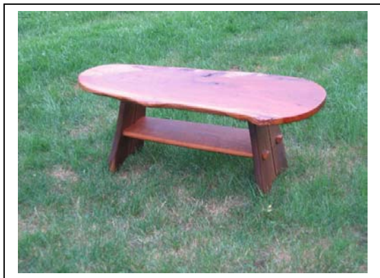
Cedar table by Todd White