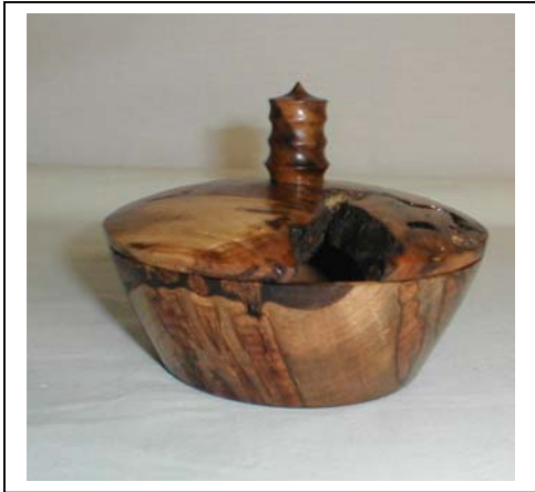
Ambrosia Maple box