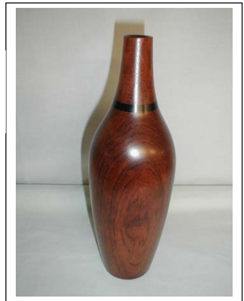
Bubinga and Ebony bottle by Phil Reed