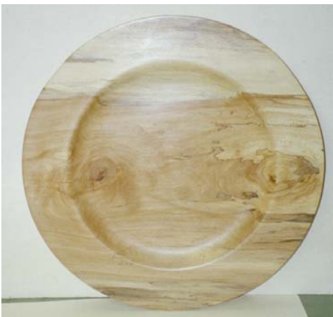
(Left) Spalted sycamore plate by Don Naylor (15" diameter)