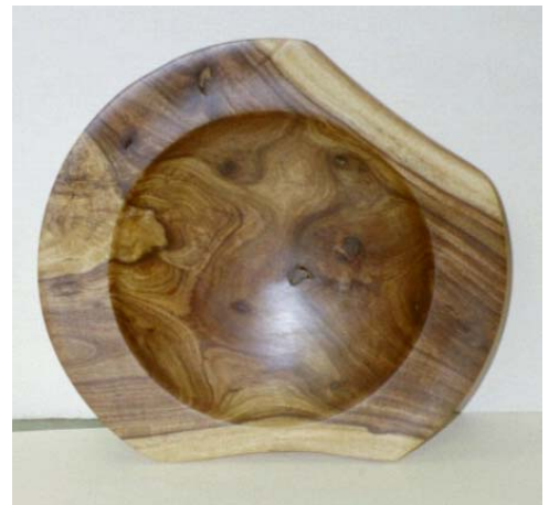
(Right) Tambotie plate by Dean Swagert (8" diameter)