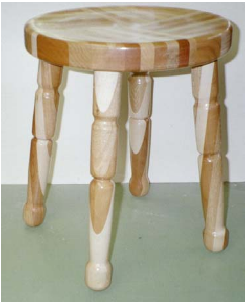
(Left) Stool of Cherry, oak, maple & mahogany by Elmer Absher (15" high x 13" diameter)