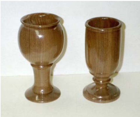
(Left) Walnut goblets by Don Titus (7" high x 4" diameter and 6½" high x 3" diameter)