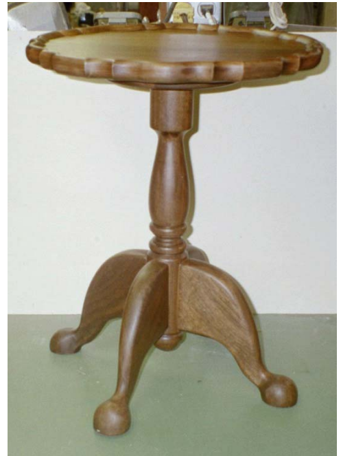
(Right) Walnut tray table by Tom Elledge (21" high x 14" diameter)