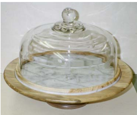
(Right) Stool by Phil Reed. Poplar seat and maple legs (24" high x 14" diameter)