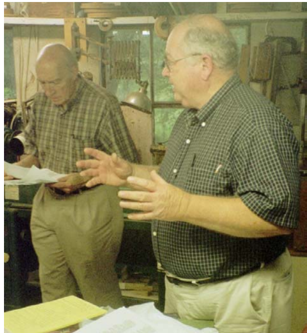
Shelleman emphasizes the importance of knowing your limitations in the shop