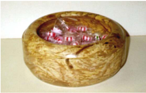
(Left) Spalted maple bowl by Don Titus (7½" w x 4" h)