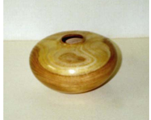
(Right) Maple burl hollow form by Dave Barkby (4" w X 2½" h)