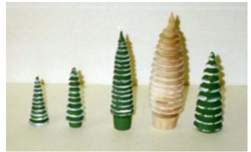
(Right) Selection of turned Christmas trees by Dale McCoy (1-2" w x 3-7" h)

Pictures from the Christmas party, December 9, 2003.