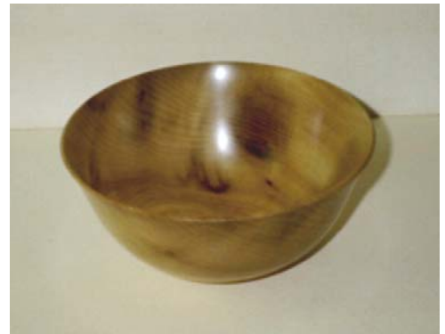
(Right) Myrtle bowl by Phil Reed (7" w x 3½" h)