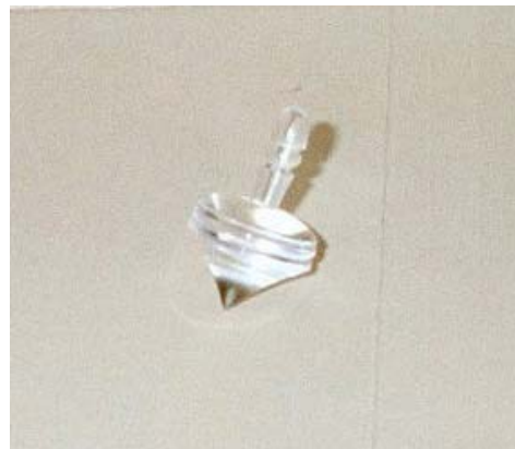
(Right) Acrylic top by Dave Smith (1" w x 1 1/2" h).