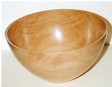
(Left) Bradford pear bowl by Phil Reed (9" w x 5" h)