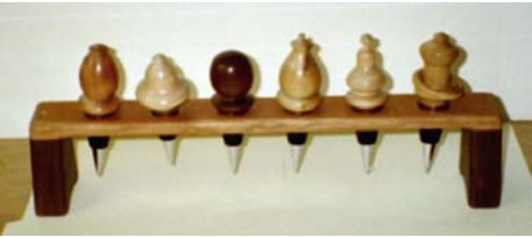
(Left) Selection of wine bottle stoppers by Todd White (various woods)