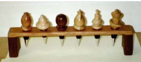
(Left) Selection of wine bottle stoppers by Todd White (various woods)