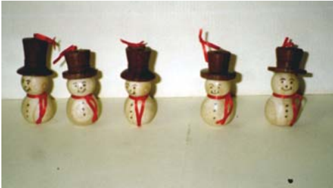
(Left) Collection of snowmen turned by Mike Galloway, Maple with walnut hats