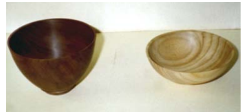
(Right) Bowls by Phil Reed; Walnut (4" w x 3" h) and Dutch elm (4½" w x 2" h)