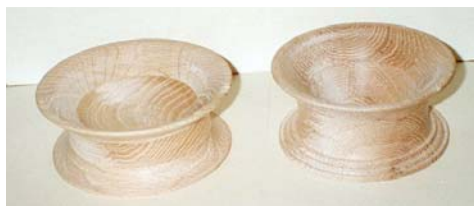
(Left) Oak bowls by Don Titus (5 1/2" w x 2 1/4" h and 5" w by 2 1/2" h)