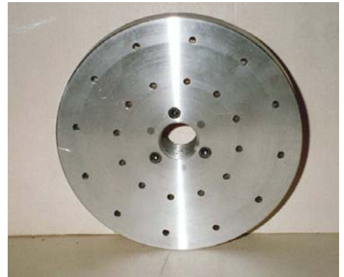
(Right) Aluminum face plate by Elmer Absher (6" diameter).