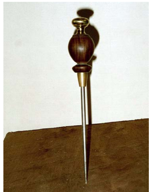
(Right) Scribe made by Todd White and used as a prototype for the tool making at the July meeting.