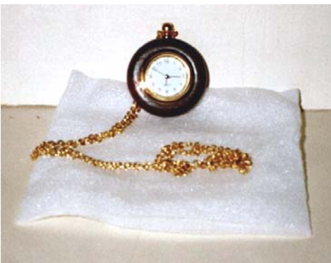
(Left) Picket watch turned by Elmer Absher (1½" diameter)